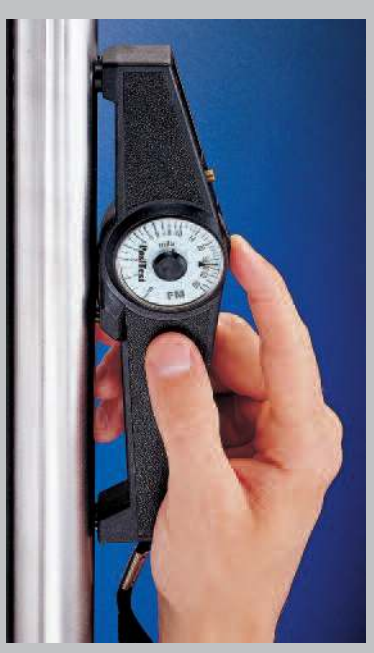
Stable design with additional tail-end support. No annoying rocking during measurement.