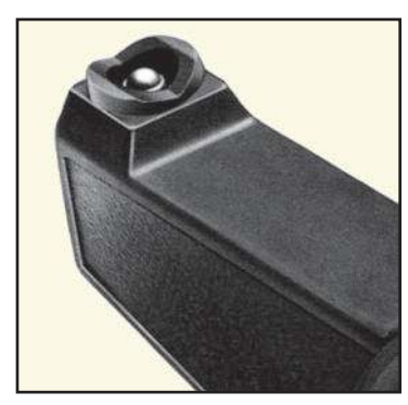
Carbide measuring probe for long life.